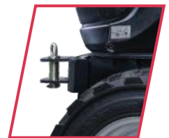
STANDARD FRONT TOW HOOK